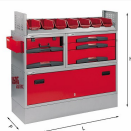
5006 EF2 - Assortment for left side